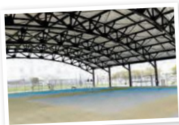
Lessons for beginners are offered on the indoor tennis courts

Park ☎06-6991-8200 (Oeda Park Center) 📍1-80 Matsushita-cho, Moriguchi City 🚶Enter any time 🅐Parking available 🚶10-min walk from Keihan Moriguchishi Station 🗺️15 B-3