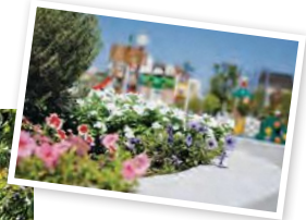
Beyond the seasonal flower beds there is a large jungle gym so both parents and children can enjoy the park