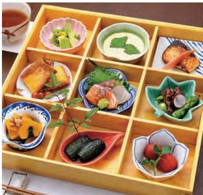
Nine types of small bowls, with a stewed dish, rice cooked in an earthenware pot, and dessert included. Lunch-only small bowl course 1980 yen

☎06-6926-9694 📍7-4 Shogetsu-cho, Moriguchi City 🕒12:00 PM-1:30 PM, 5:00 PM-10:00 PM 🗨Closed Mon, Tue 🅐Parking not available 🚶7-min walk from Keihan Moriguchi Station MAP 15 B-1