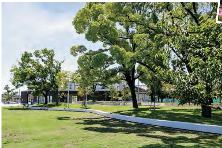
A serene, manicured natural lawn. Outdoor yoga classes are also popular

Moriguchi City has many places to experience nature such as Oeda Park in the middle of the city and other locations famous for azaleas and ginkgo. Take a deep breath and refresh your body and mind.