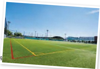
A multipurpose field perfect for baseball, soccer, or rugby

There are also promenades and jogging courses in the park.