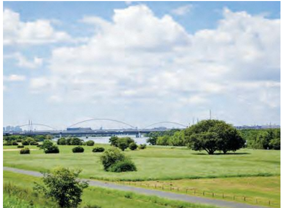
The Satanishi area overlooking Torikai Ohashi Bridge with its beautifully highway shaped arches

Park ☎06-6994-0006 (Yodogawa Riverside Park Moriguchi Service Center) 📍From Satanishi-machi to Dainichi-cho, Moriguchi City 🕒9:00 AM-5:00 PM (differs by area) 🗉Open all year 🅐Parking available 🚶10-minute walk from Niwaji Danchiguchi bus station MAP 15 B-1