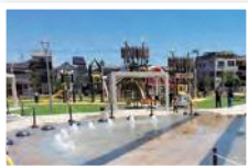
A water playground for excited children to cool off