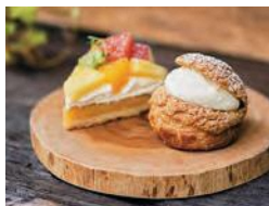
(Left) Seasonal fruit tart 480 yen (Right) Cookie cream puff 220 yen