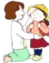
1 . Home health check