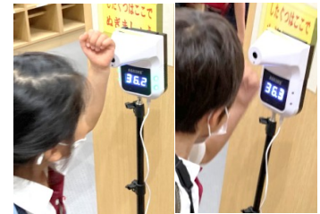
2 . Taking temperature at school